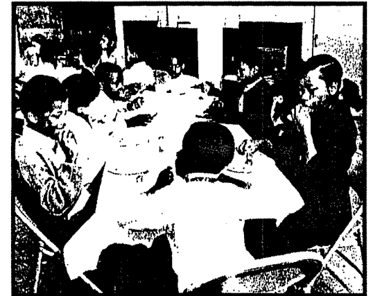
Free Breakfast for Children Program

Most of all, NASO is about the future and struggling to secure a better future for the children and the generations yet unborn. The struggle for the future begins now, and we must dare to struggle and dare to win! No one is going to save us. We must be our own liberators!